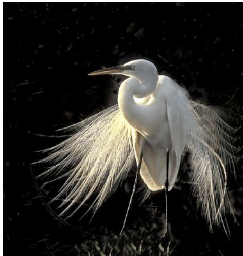
Egret with Side Lighting