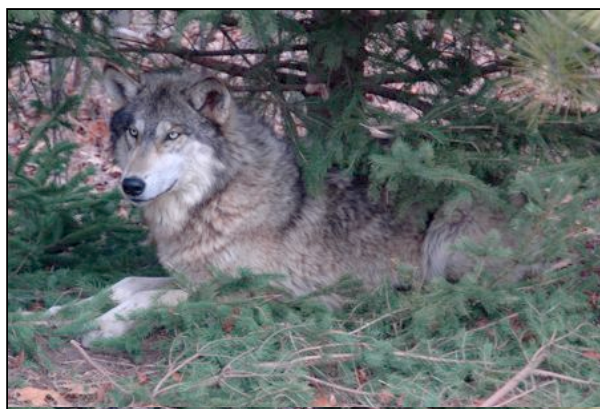
Wolf provided by Wildlife Connection at Spring Break